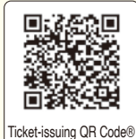
Ticket-issuing QR Code®

Only same-day tickets can be purchased. Sale is not available on days when the Donichi Eco Kippu (Weekend Eco Ticket) cannot be used.